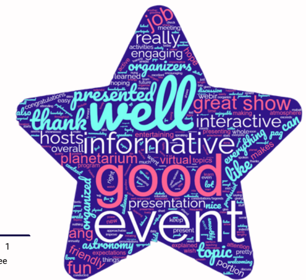
Word Cloud of the Audience Feedback