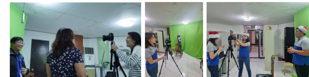
The team's collaborative effort made this science communication activity possible.

Playlist: https://www.facebook.com/watch/302746419835274/1069428283833308 Get in touch: f https://www.facebook.com/PAGASA.DOST.GOV.PH g https://bagong.pagasa.dost.gov.ph/ e astronomy@pagasa.dost.gov.ph